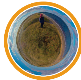
Moving - Gathering