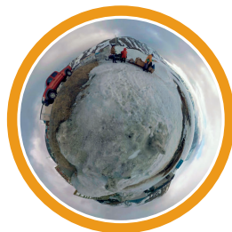
Occupying the Territory